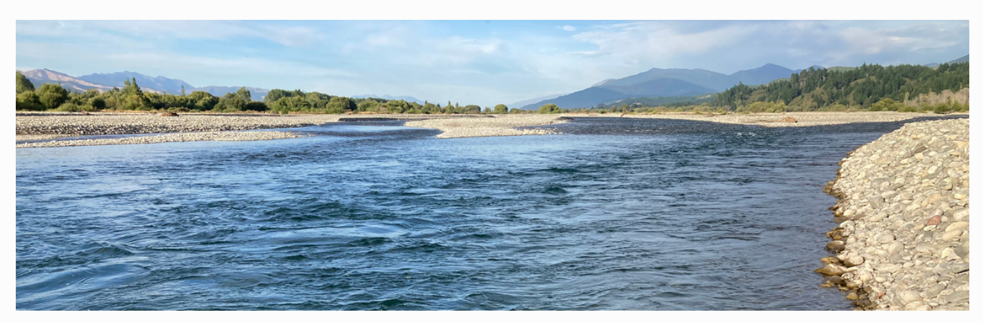
Wairau River, Marlborough

A quarterly newsletter for stakeholders of the TWOTW Research Programme