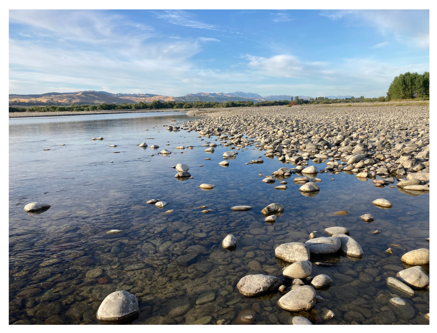
Wairau River, Marlborough

In the first week of February 2022 we performed a successful sampling campaign in the Wairau River, covering nearly its entire length, between the coast and Dip Flat. Together with Marlborough District Council (MDC) we collected 140 radon samples to identify where the river interacts with the groundwater system, losing or gaining water. We found a very complex groundwater system discharging into the Wairau River in its lower reaches, where the confining layer is relatively thin and obtained liquefaction damage following the 2016 Kaikoura earthquake. Up to now, very little was known about the natural discharge of the Wairau aquifer - an essential parameter for water resource management. This work is part of a collaboration between MDC, and GNS' groundwater SSIF programme to establish new techniques for water resource management, and the MBIE Endeavour programme Te Whakaheke o Te Wai to produce national understanding of groundwater - surface water interactions.