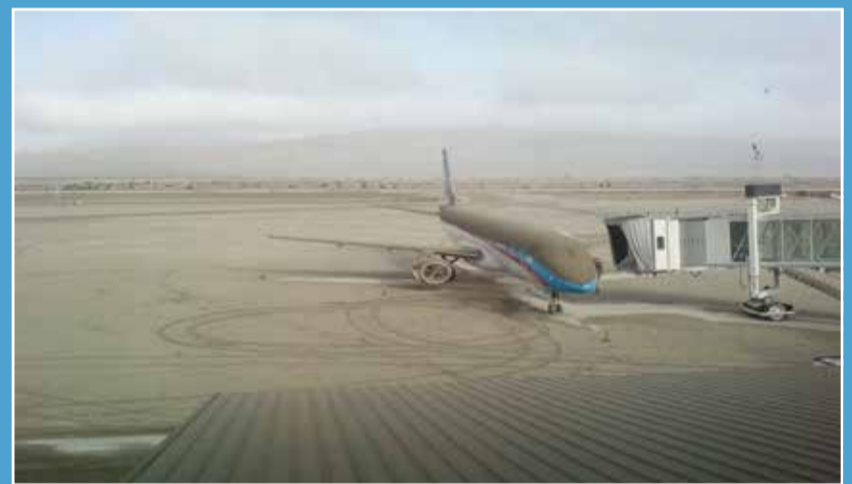
5-10 mm of ash fall at San Carlos de Bariloche International Airport in Bariloche, Argentina, following the June 2011 eruption of Peyuhue Cordon-Caulle volcano in Chile. The airport closed for 31 days due to the on-going ash falls, remobilisation of ash and cleanup.