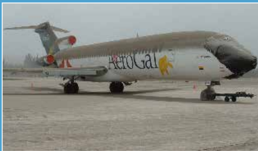
3-5 mm of ash fall at Mariscal Sucre International Airport in Quito, Ecuador, following the 3 November 2002 eruption of Reventador volcano. The airport closed for 8 days due to the ash deposition on aircraft and runways.