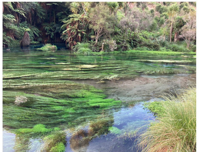
Blue Spring, Waihou River, Waikato (Uwe Morgenstern)