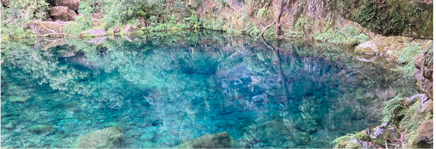
Lost Lagoon of Kuratau, Waikato

A quarterly newsletter for stakeholders of the TWOTW Research Programme