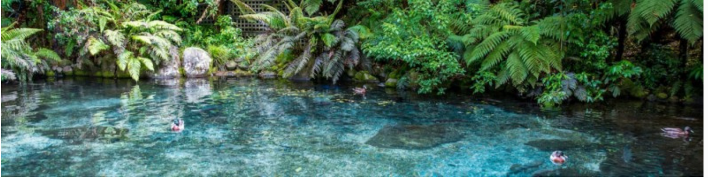
Blue Spring, Waihou River

A quarterly newsletter for stakeholders of the TWOTW Research Programme